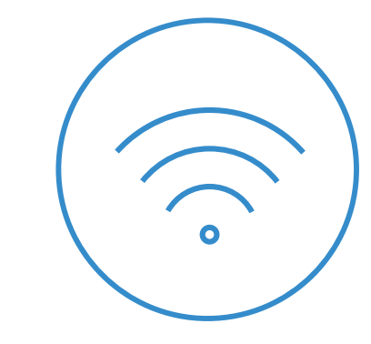
Wi-Fi Connection at Public Areas